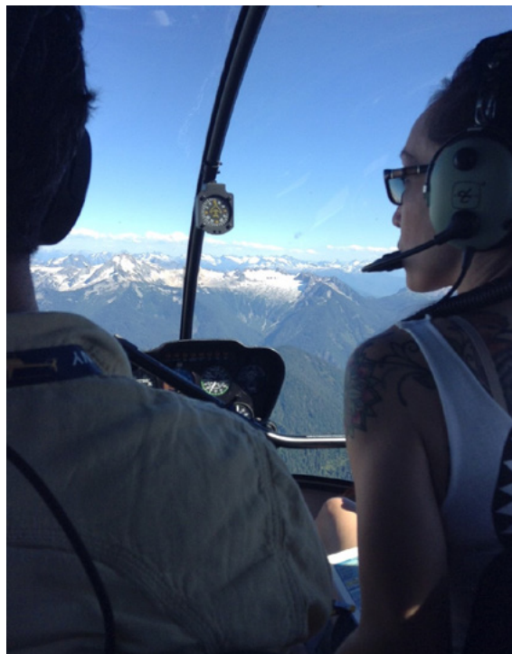
Flying over the North Cascades! Took off from BLI

A: My spirit animal is a spider monkey. I am a wackadoodle at heart, I try to find the funny in even the worst situations. I'm an amateur aviator and especially love helicopters (I've got about 150 hours in the Schweizer 300, R22, & R44).